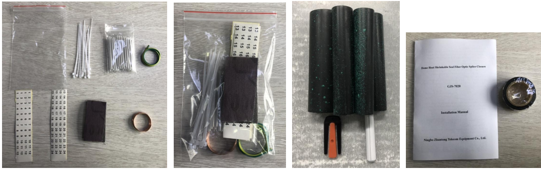
The pictures are for inspection reference and are not used as the basis for the inspection of the number or specifications of the accessories