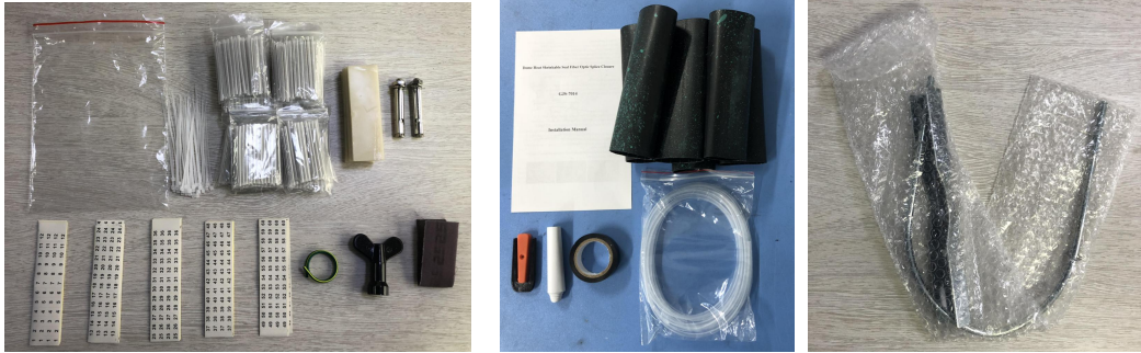
The pictures are for inspection reference and are not used as the basis for the inspection of the number or specifications of the accessories